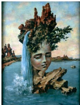
Arizona Landscape (1943)

We will also use the artists Dorothea Tanning (1910 – 2012), an American artist known for her surrealist work. She was also married to Max Ernst, another surrealist artist.