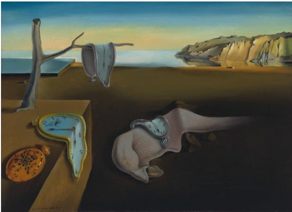
The Persistence of Memory (Dali 1931)

We will be studying the work of the surrealist painter: Salvador Dalí (1904 – 1989) a Spanish artist most famous for being a Surrealist painter and sculptor. The Persistence of Memory is one of his most famous pieces of art.