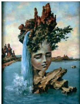
Arizona Landscape (1943)

We will also use the artists Dorothea Tanning (1910 – 2012), an American artist known for her surrealist work. She was also married to Max Ernst, another surrealist artist.