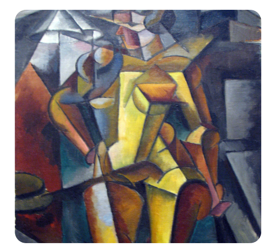
The Model by Lyubov Popova, 1913