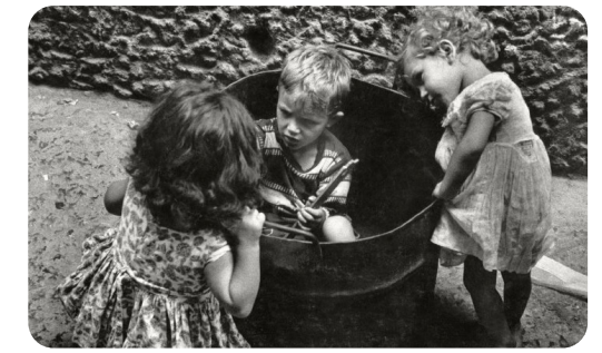
Naples, Italy – Children by Herbert List, 1961