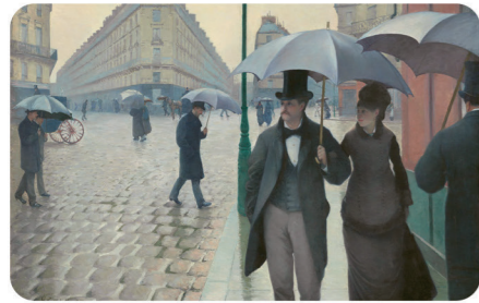
Paris Street; Rainy Day by Gustave Caillebotte, 1890