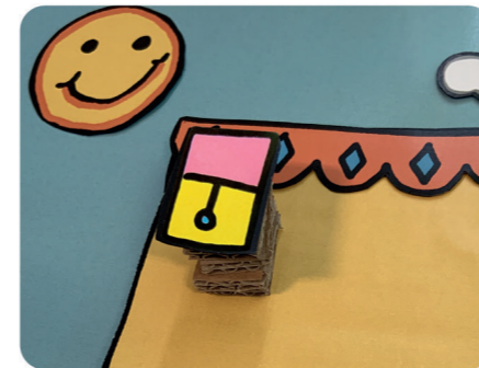
Five layers of cardboard make this window stand out.

Layers of corrugated cardboard can be glued to the back of cut outs to create a 3-D effect.