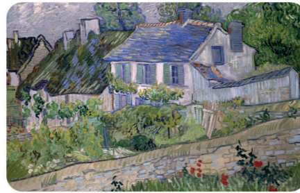
Houses at Auvers by Vincent van Gogh, 1890